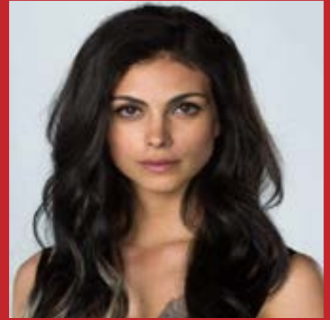
Morena Baccarin The Mentalist, Gotham