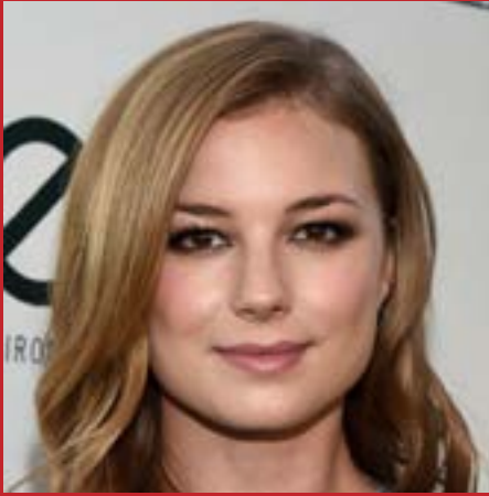
Emily VanCamp Revenge, Falcon and The