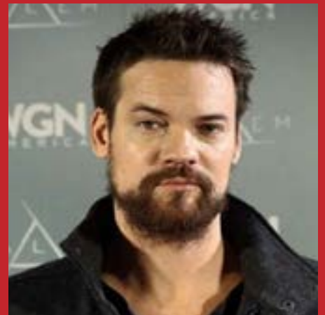
Shane West Nikita, Salem