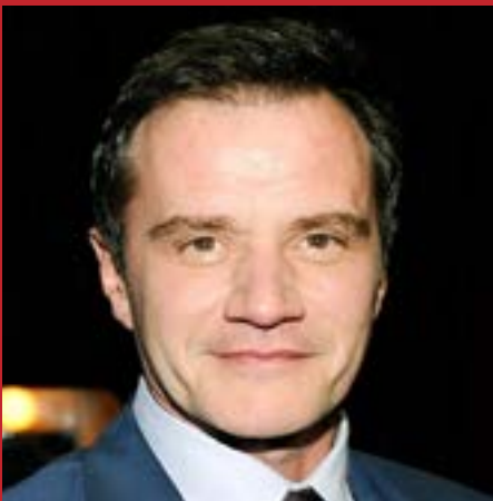
Tim Dekay White Collar, Second Chance