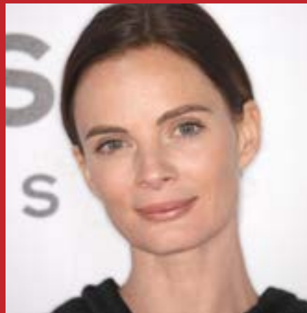
Gabrielle Anwar Burn Notice, Once Upon a