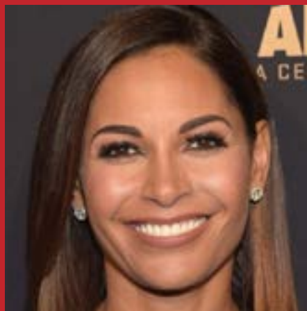
Salli Richardson Eureka, Stitches