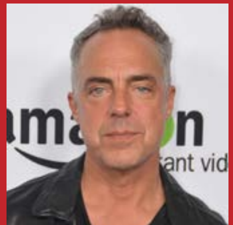
Titus Welliver Bosch, Deadwood