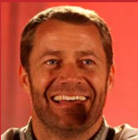
Colin Ferguson Eureka, Coupling